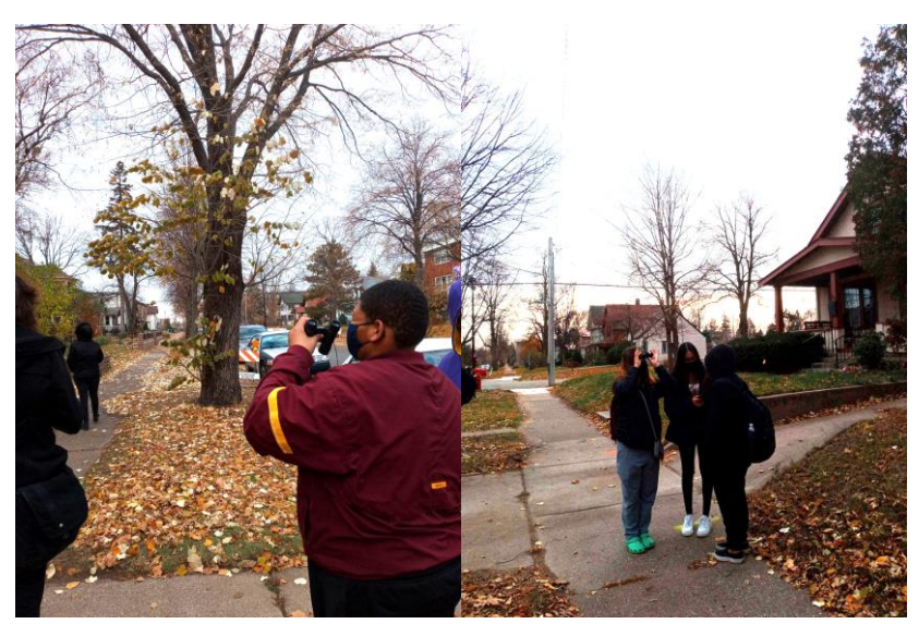
Weekly Student Bird Walk

South High students are very grateful for the support of the Minnesota Ornithologists' Union Savaloja Grant Program! The Indigenous Bird Knowledge Project brought Ojibwe bird stories, basic birding skills, and knowledge of bird habitat needs to 130 Indigenous, immigrant, and refugee students at South High.